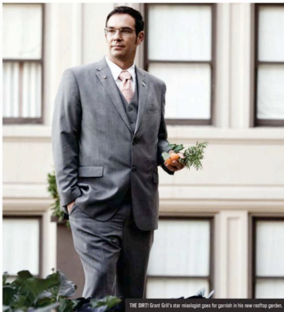
THE DIRTY! Grant Grill's star mixologist goes for garnish in his new rooftop garden.